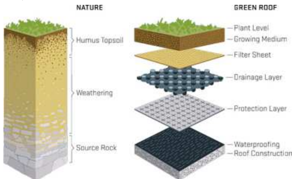
Fig. 1. Green roof systems mimics the natural soil layers

Green Living Roof (GRL) assembly. Green roof construction mimics in a few centimeters what normal soil does in a couple meters, as shown in Fig. 1. The green roof accomplishes natural balance through several layers.