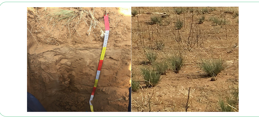
Figure 3. The soil profile of microelevations and the corresponding landscape