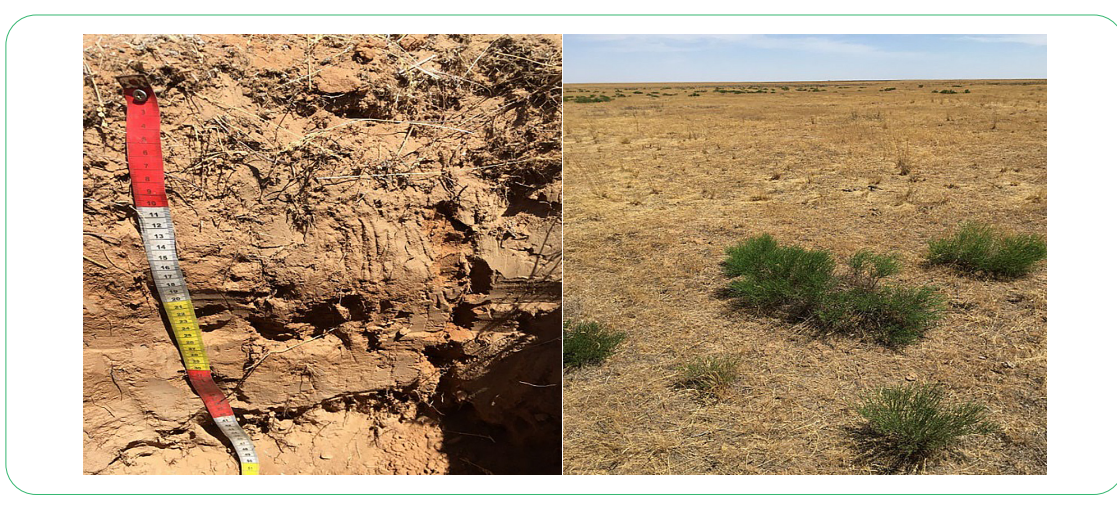
Figure 1. The soil profile of the background plots and the corresponding landscape

The light humus soil of microdepressions is represented by AJ (depth 0-12 cm) light humus horizon: grey fawn, dry, structureless, fine sandy loam, slightly compact-